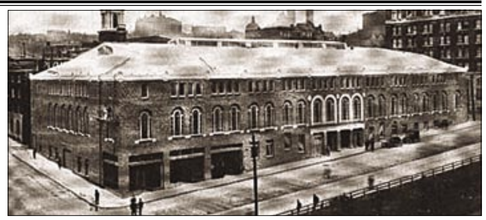
The Seattle Arena was the Metropolitans' home ground for many years.

Unaware of what lay ahead, the hometown fans got primed and ready for what promised to be a hard fought series. The Seattle Arena management worked diligently to make sure every-